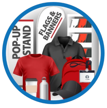
Marketing Fulfillment Create, customize and distribute printed and promotional material.