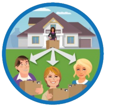
Direct Sales Fulfillment Serve the unique fulfillment needs of your sales consultants and party planners.